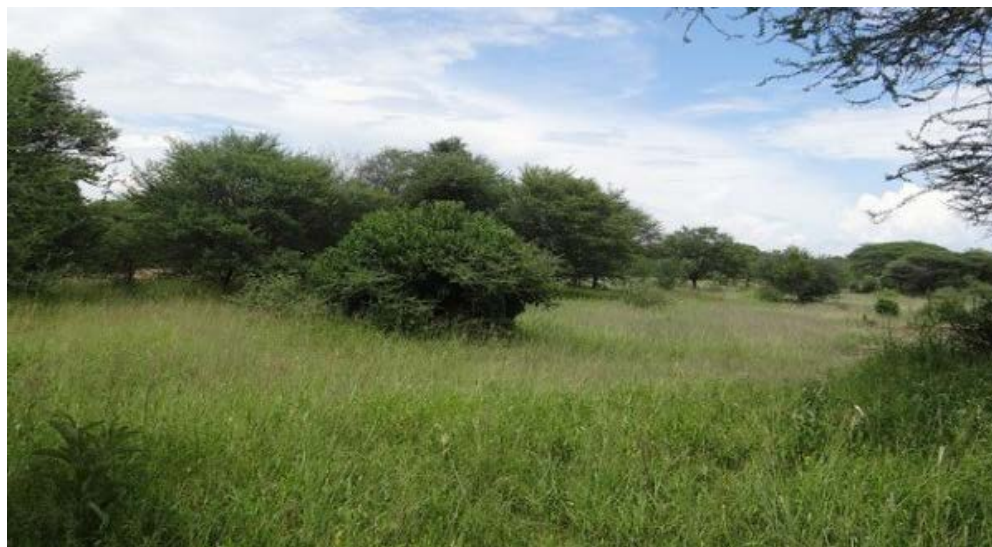
Restored degraded areas after long-term investments.