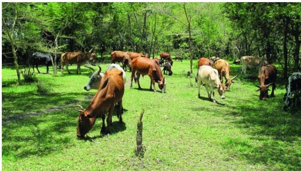
Cattle grazing in degraded woodlands.

collect fuelwood, the forage badly needed by the oxen was no longer available, and the wild fruits and medicinal plants became rare to find.” 3