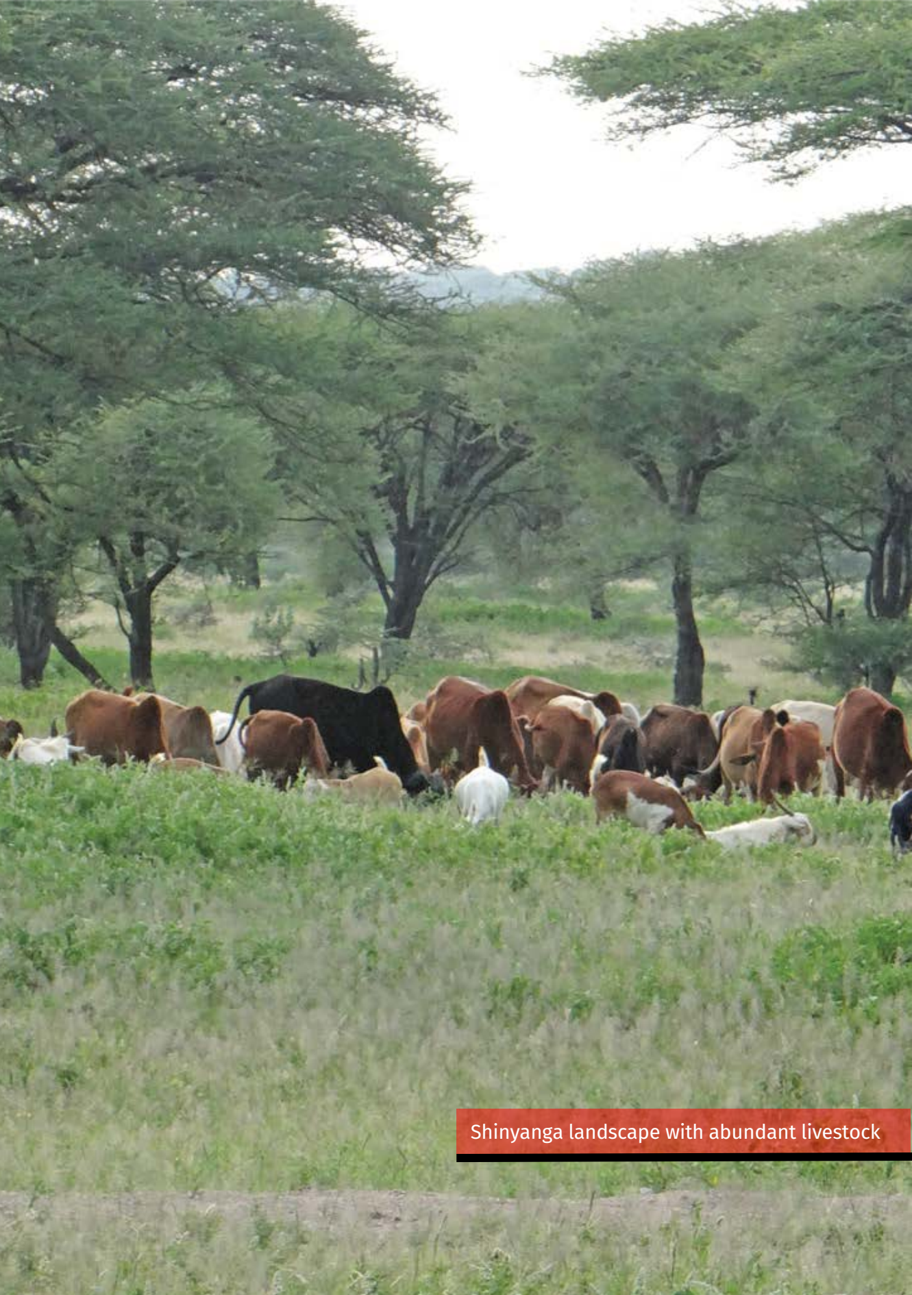
Shinyanga landscape with abundant livestock