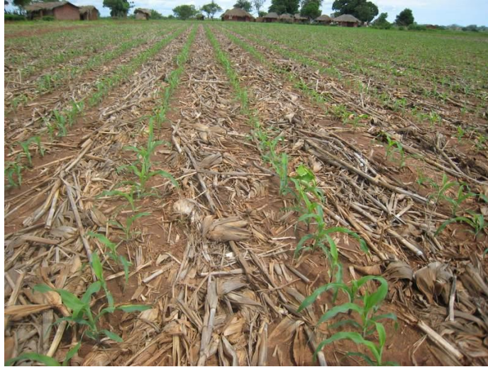
Figure 3: Maize field under “old ridge” tillage or flat tillage in Nkhota kota under MACC project of TLC in 2009