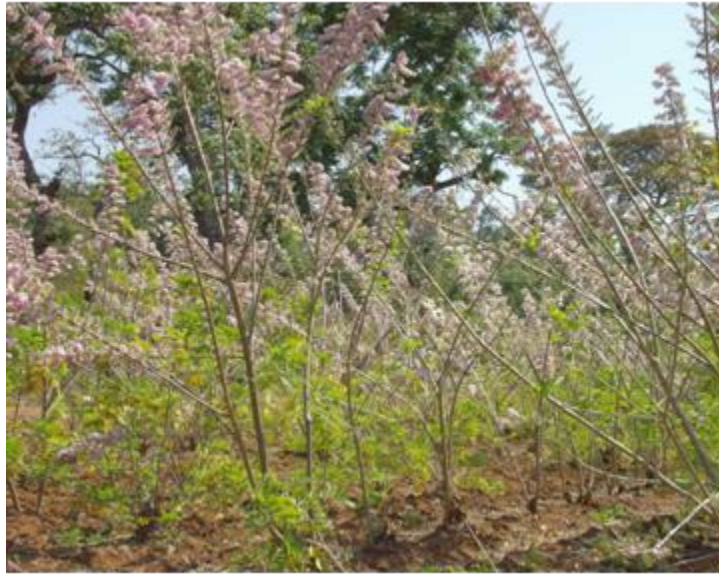
Figure 8: Flowering Gliricidia sepium trees during during season

Gliricidia is a fast-growing, nitrogen-fixing leguminous tree that is used in agroforestry to add nitrogen and organic matter to the soil. The nitrogen fixing ability and nitrogen-rich leaves of Gliricidia sepium make it an ideal intercropping plant in the nitrogen deficient soils in Malawi.