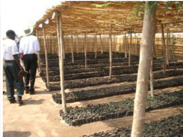
Figure 10: Well managed nursery with a shed.

Water the nursery once in the morning and once in the evening everyday until germination. After germination, watering should be reduced to once a day, depending on local weather and soil conditions. Inadequate or excess water will slow the development of the seedlings, and will hamper field establishment. Seeds and seedlings should be protected from water damage by applying water slowly through grass, a gentle watering can or a plastic bag with small holes.