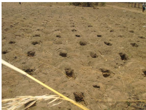
Figure 4: Land preparation for permanent planting basins

Adapted from a guide to Conservation Agriculture in Zimbabwe (2009) and Sasakawa Global 2000