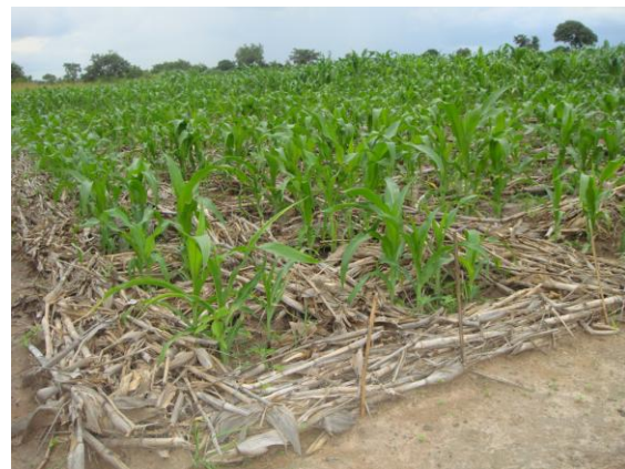
Figure 5: Maize planted in the permanent planting basins