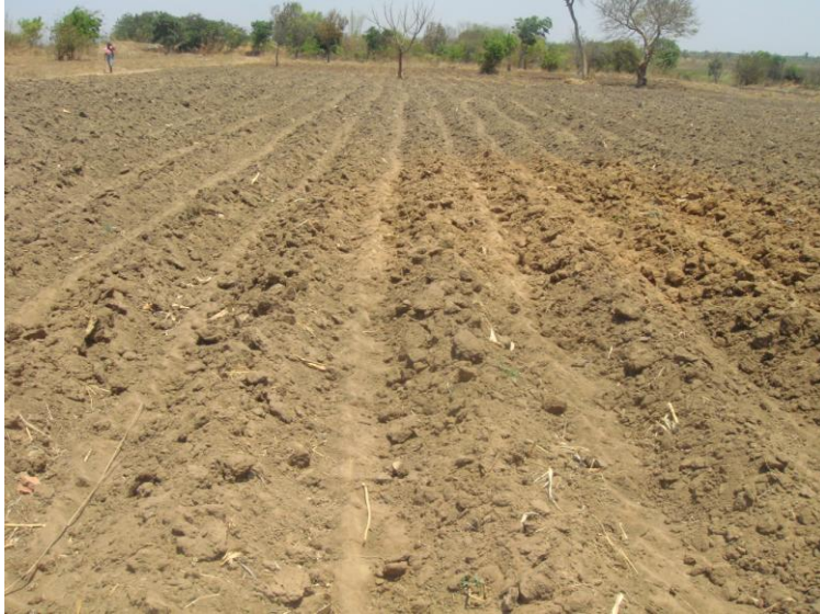
Figure 1: Crop field tilled with hand hoe by a smallholder farmer