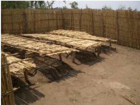
Figure 9: Nursery roof for seedling

After seeds are sown, dried grass should be placed on top of the raised beds or containers to avoid water loss and damage from watering. When the seeds have germinated, a shade “roof” should be constructed to protect the seedlings for a few weeks. The “roof” should be approximately 70 cm high. The roof should be removed to expose the seedlings to full sun in the weeks before transplanting.