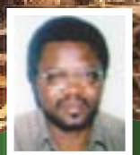
Tribute to Christophe Zaongo Page 14