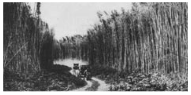
Native bamboo forest, Arundinaria alpina, in Kijabe, Kenya 1927

Kenya's Raiply has reportedly begun importing timber from the Congo and Tanzania to manufacture hardboard and soft board, while Panpaper Mills in Webuye, which manufactures much of the country's paper, uses plantation softwoods to fuel its boilers and make paper pulp. ICRAF believes that bamboo can solve both problems owing to its fast maturing nature and biomass.