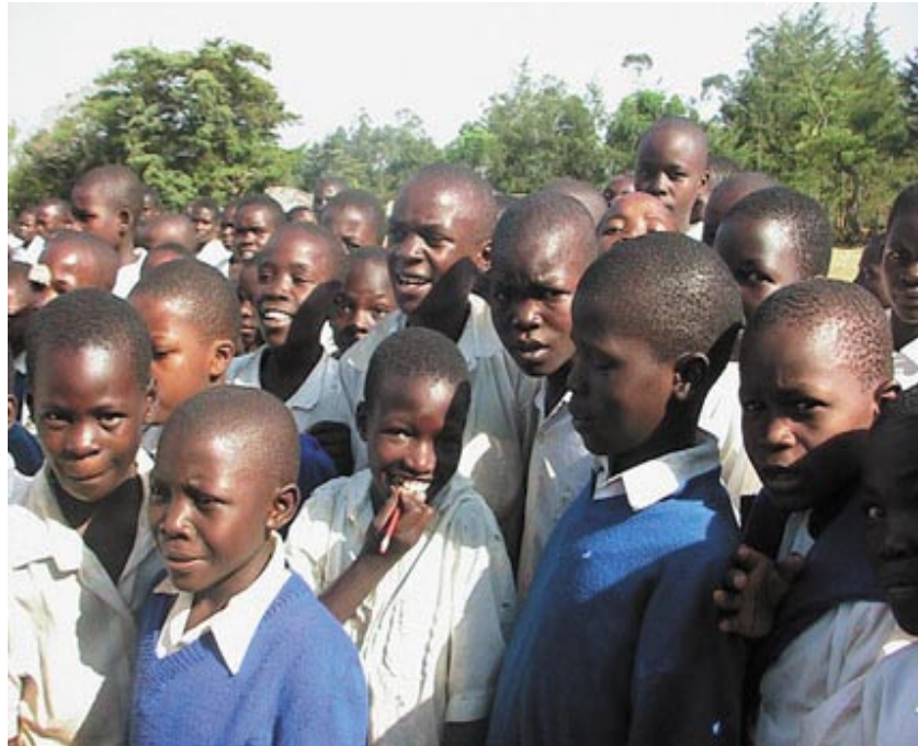
Students from the Bar Sauri Primary School in the village of Yala, Nyanza Province, Kenya. All thirty-three of the students who sat for the national exams passed, with the help of a local school lunch program.

"The power of school lunches supported by local farmers is really catching fire," says Sanchez. "The Hunger Task Force strongly supports this great idea" in combination with other feeding programs that target mothers and very young children. It is satisfying, Sanchez added, not only to know that HIV/AIDS orphans