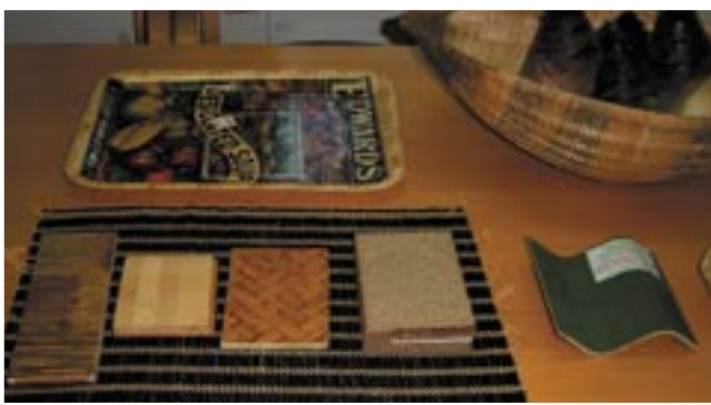
Bamboo can be used for a wide range of products such as edible shoots, mats, roof and floor tiles