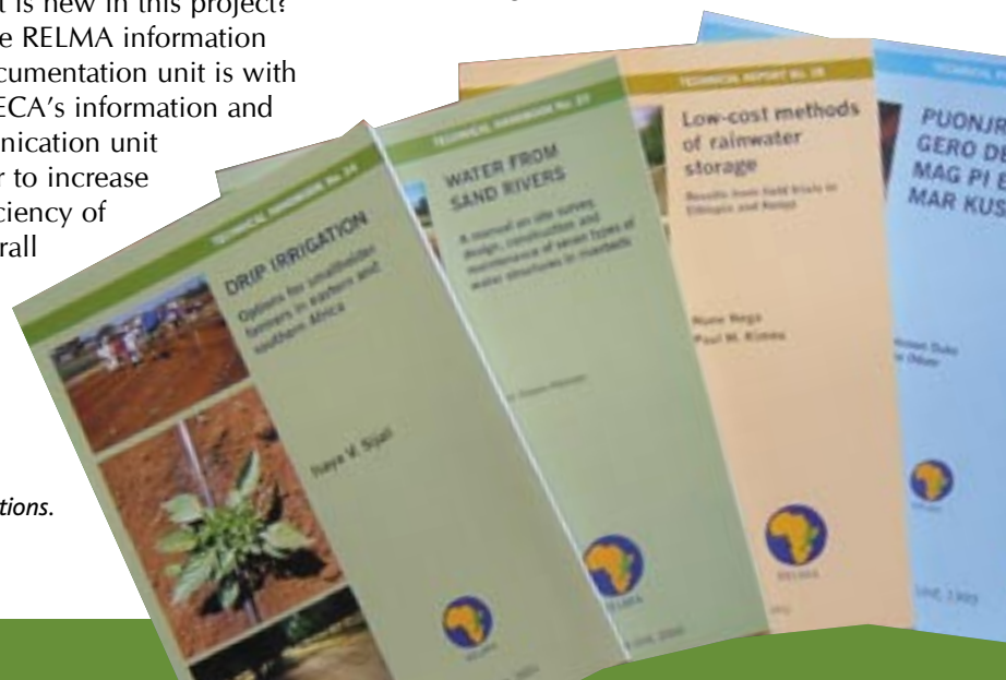
RELMA's range of publications.