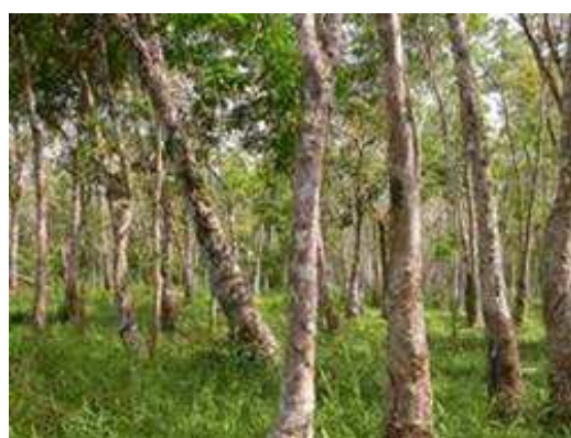
Figure 3. Rubber plantations on peat dome