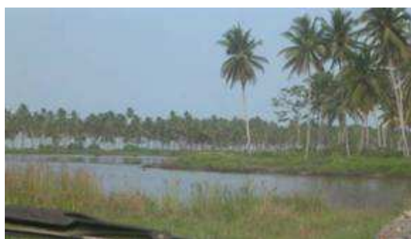
Figure 5. Coconut along coastal area