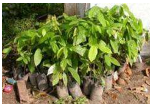
Figure 6. Cocoa seedlings ready for planting in the field.

World Agroforestry Centre (ICRAF) is one of 15 organizations under the CGIAR (Consultative Group on International Agricultural Research) umbrella. ICRAF aims to stimulate and conduct innovative research, development and capacity building to promote and support agroforestry for both human and environmental benefits. ICRAF has its headquarters in Kenya and six regional offices in the tropics and now cover 21 countries in Africa, Asia and Latin America.