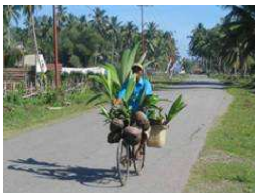
Figure 4. Coconut seedlings for planting after the Tsunami damage