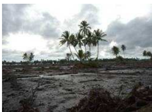
Figure 2. Tsunami damaged coconut in West Aceh