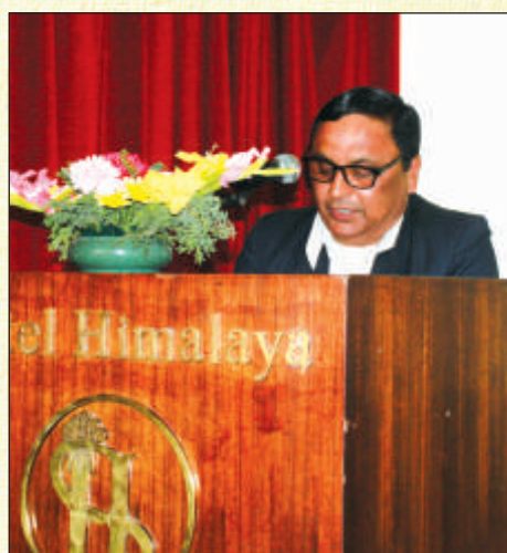
Hon'ble Minister of MOAD Mr. Hari Prasad Parajuli releasing "Kathmandu Declaration on Agroforestry" on 28th March, 2015