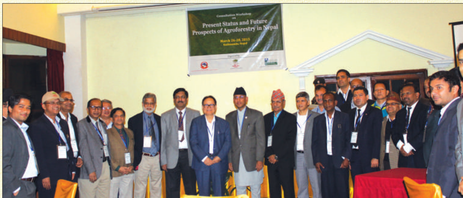
A group of participants with Honourable Minister of Forests and Soil Conservation Mr. Mahesh Acharya (centre in traditional dress)