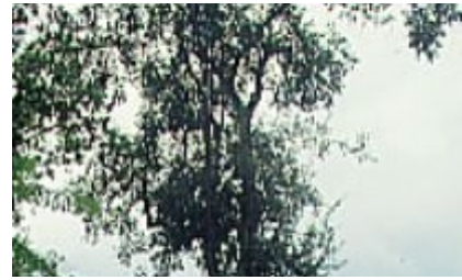
Flacourtia indica (Patrick Maundu)

The tree is usually leafless just before flowering. In India, the flowers appear from December to April together with the new leaves, which are a very beautiful fresh green colour. Fruits ripen from March to July. They are eaten by birds, thus the seeds are widely dispersed, accounting for the very wide distribution of the species.