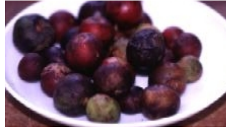
Flacourtia indica (Anthony Njenga)