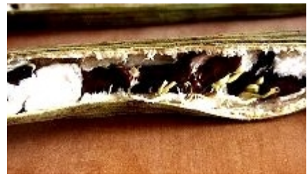
Inga edulis: Inga edulis fruits sold by the side of the road in Iquitos city, Peru. (Soraya Alvarenga Botelho)