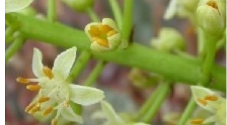
flowers