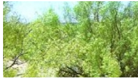
Prosopis glandulosa var. glandulosa Mesquite bushes in population and control studies at Santa Rita Experimental Range, Arizona. (Tropical Forage Legumes, FAO, 1988)

Hybridization is common, and the taxonomy of P. glandulosa is difficult. Genetic variability is high, with good potential for selection of individuals and ecotypes and plant breeding. The trees are self-fertile. It has been suggested that P. glandulosa , or cultivars thereof, hybridizes with P. laevigata and P. velutina . Highest biomass production among progeny of hybrids, possibly with South American ornamentals, have been reported. Coppicing ability and psyllid resistance are similar to P. alba , but the leaf and thorn morphology more closely resemble P. glandulosa (chromosome numbers 2n = 28, 56, 112 ).