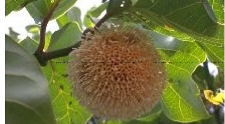
Sarcocephalus latifolius foliage