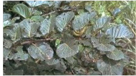
Sarcocephalus latifolius foliage

A hermaphroditic tree flowering from April-June. Fruits ripen from July-September. The grey baboon ( Papio anubis ) disperses its seeds.