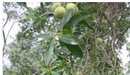
foliage and fruit

W. ugandensis is hermaphroditic, flowering at the beginning of the rainy season. Fruiting follows later in the rainy season; fruits may remain on the tree for a long time. In Kenya, the species flowers in December-January and seeds in May.