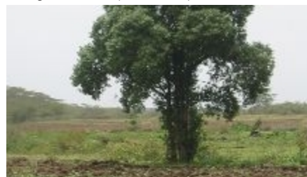
Tree on farm